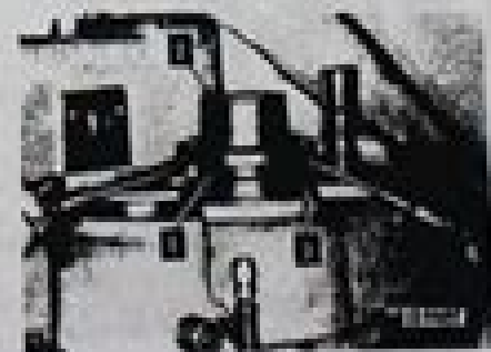
Diagram 12 Removing the Input Shaft Support and Shim

5. Remove the transmission pump support with sealing ring from the clutch shaft. Remove the bearing spacer (Sheet, 11).