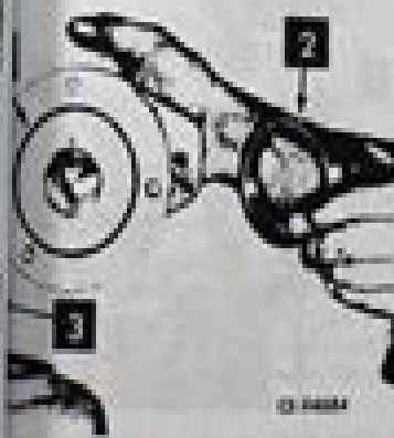
Diagram 11 Removing the Transmission Pump Support