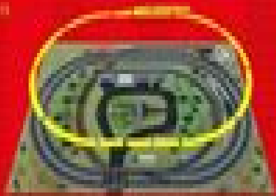
A Hornby® electronic decoder is supplied free with the RailMaster software