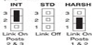
Figure 5. Pulse Processing Options

See Figure 4 for location of Pulse Processing selection jumper link.