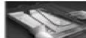
Classics - surveys, suggesting plans and some structuralist, but - often not

14 http://www.fishbase.org . Accessed 12/12/2007.