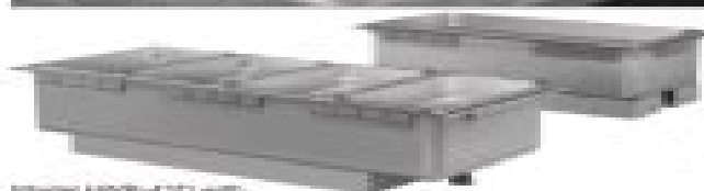
Model HYPER-TURT with secondary feed point (included but not shown)