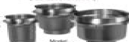
800-875-1122 with processing food over