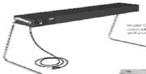
Model GPR-48 with optional Designer color infinite switch, continuous up let, and accessory C-leg stand.