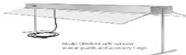
Model GPR-48 with optional sneeze guard and accessory C-leg.