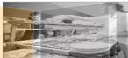
Remote Control Enclosures