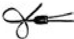
Jabra EHS cable for Siemens