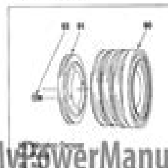
Figure 71: Crankshaft Damper and Pulley