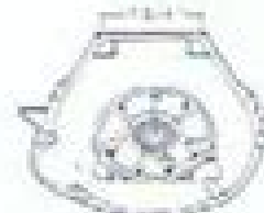
Ford 1A, 429, 460, 21-48, 420R