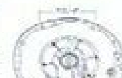
Chrysler TH-727 & 904, 373, 318, 340, 360