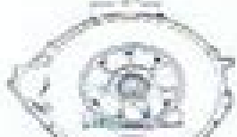
Ford C4, 302, 352, 360, 390, 400, 427, 429