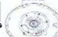
Chrysler TH-727, 341, 360, 400, 476, 440