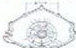
GM Powerglide Aluminum