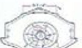
GM TH-400, 350, 295-48, 700R4, 3.80, 4.10, 4.62R Chevrolet