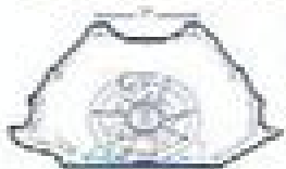
GM TH-400, 350, 295-48 Buick, Olds, Pontiac, V6, V8