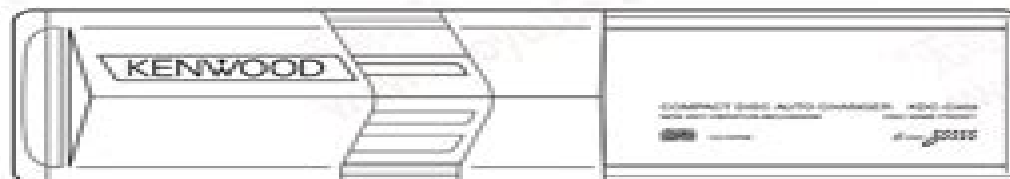
Illustration is KDC-C669/Y.