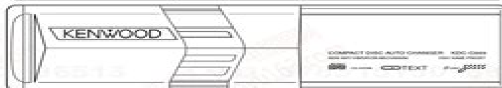
Illustration is KDC-C469FM/FMA.