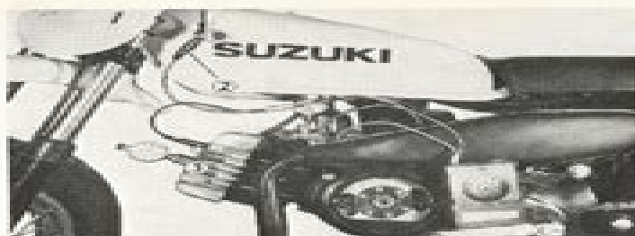
Fig. 81. Connecting timing tester.