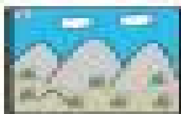
1. Journal of Management Education , 2000, 24(1), 1-10.