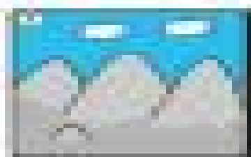
Keywords: social support; coping strategies; self-esteem; depression