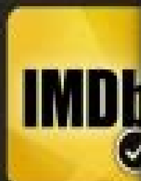
IMDb Movies &amp; TV Shows