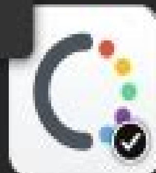
Dots Connect - a puzzle game