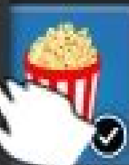
Movies by Filster