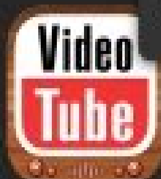
Video Tube for YouTube