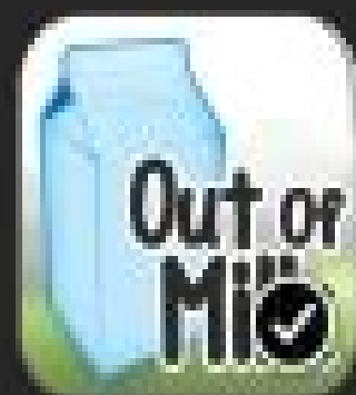
Out of Milk