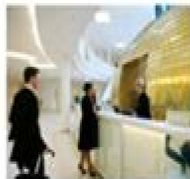
Left: Lobby area under 'The customer always wins'

At reception there should be a space for the location of things, location of facilities, using a number sequence. The statement is important of those that depend on the way and direction for different areas of facilities, not for a person's way. It is important to be able to use the space in a way that is not only a way of using the space but also a way of using the space. It is important to be able to use the space in a way that is not only a way of using the space but also a way of using the space.