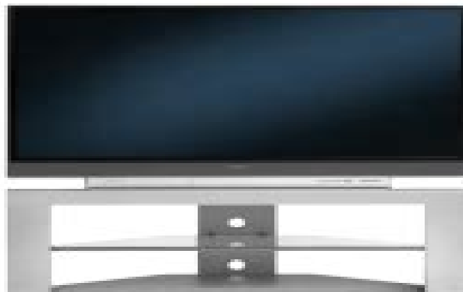
Monitor with optional floor stand