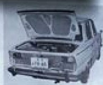
Fig. 34 Rear bonnet