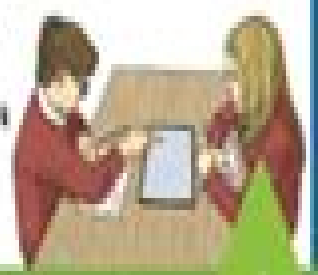
Friendship and Conflict Resolution

You and your friend were supposed to work on a homework project together, but it ended in an argument over who should do what.