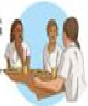
Friendship and Conflict Resolution

You and your friend had different ideas about what to do during lunchtime, and it turned into an argument.