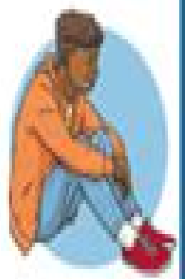
Friendship and Conflict Resolution

There was a disagreement about what game to play at breaktime, and it ended with both of you playing alone.