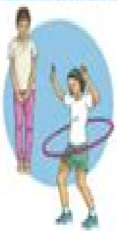
Friendship and Conflict Resolution

You and your friend both wanted to play with the same toy, and there was an argument. How you're not talking.