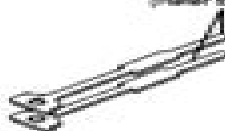
MOUNTING HARDWARE ASSY (J21-2421-00)