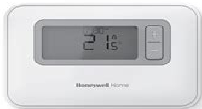
T3 Programmable Thermostat