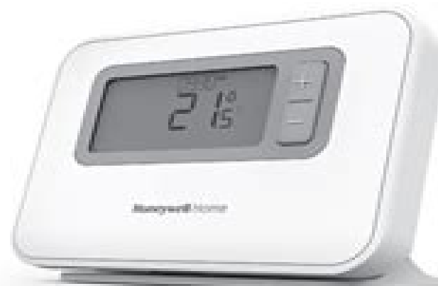
T3R Wireless Programmable Thermostat