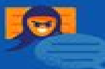
Text message spoofing