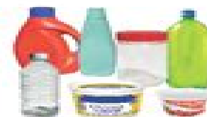
Plastic Kitchen, Laundry & Bath Containers (empty, with cap on)