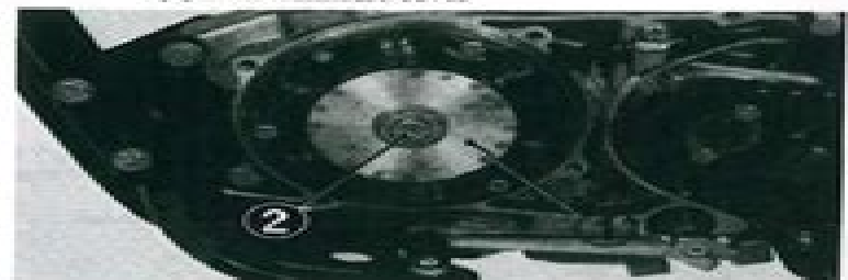
Fig. 3-80 (1) Generator rotor (2) Bolt