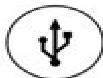
USB 2.0 *2