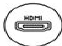
HDMI 1.4 *2