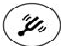
RF Tuner *2