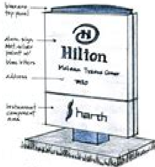
Hilton Monument Signage Concept ② white