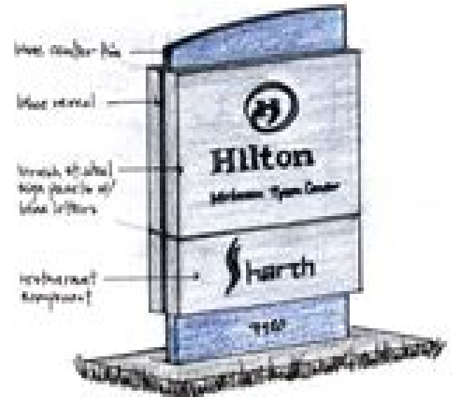
Concept ③ white Hilton Monument Signage