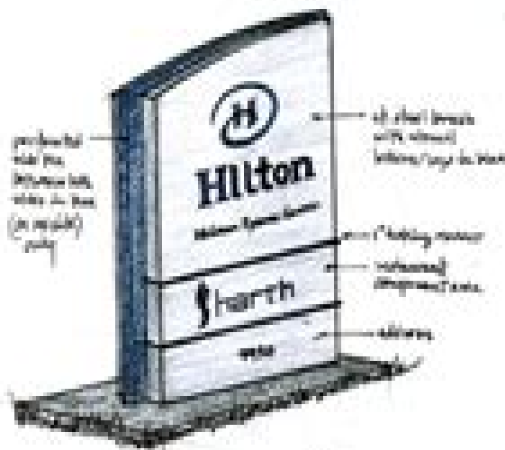
Hilton Monument Signage Concept ④ white