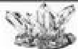
Streak test for color

Some properties of minerals are hardness, texture, color, and luster. Some common minerals are quartz, talc, and sulfur. Minerals have different uses. Halite is used to make salt, talc is used in powder, and sulfur is used in medicine. Other minerals are used to make jewelry.