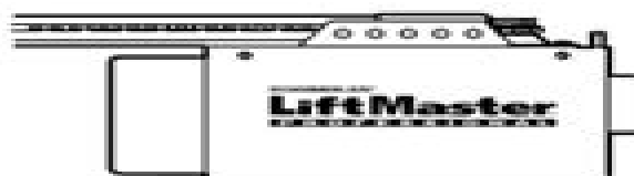
Model 1256R - 1/2HP Model 1246R - 1/3HP