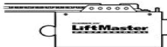
Model 1240R - 1/4HP