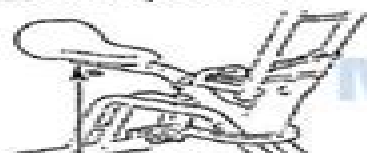
Serial Number Decal

The serial number can be found in this location shown below. Write the serial number in the space above.