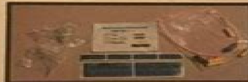
ACCESSORY KIT Spare Mouthpieces, Tamper Seals to be placed at all connections, Posi-Lock and Posi-Tap Connectors with instructions, Zip Ties

THIS MANUAL, ITS CONTENTS, AND ALL WIRING INFORMATION MUST BE KEPT CONFIDENTIAL AND OUT OF THE CUSTOMER'S POSSESSION.