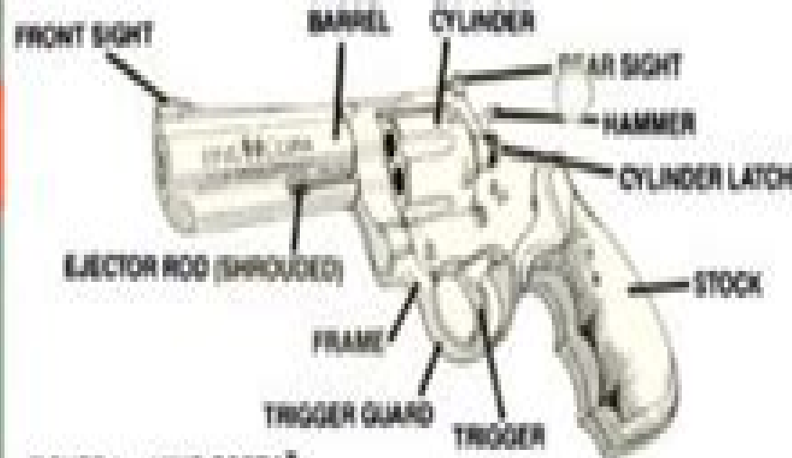
FIGURE 1 — KING COBRA™

This instruction manual should always accompany this firearm and be transferred with it upon change of ownership.