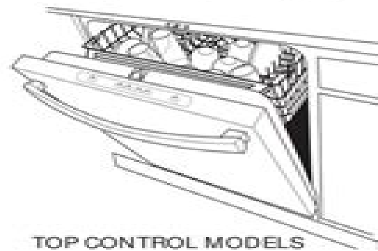
TOP CONTROL MODELS

Write the model and serial numbers here: