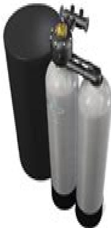
Kinetico Signature Series®