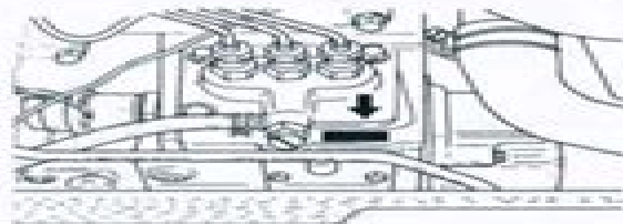
Fig. 1—Engine serial number location on all models.

Engine serial number is stamped on right, front side of cylinder block (Fig. 1) on all models. Tractor chassis serial number is located at front of range transmission housing (Fig. 2A) on Models MT300 and MT300D. On all other models, chassis serial number is located on right side of transmission housing (Fig. 2).