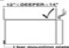
I bar mounting plate

NOTE: To ensure good performance, do not obstruct top vent airflow. If cabinets are deeper than 14" (35.5 cm) but no more than 15" (38.1 cm), use the bump out mounting kit replacing the I bar mounting plate from the wall. The bump out mounting kit (part # W11185746) is not provided but can be purchased from Whirlpool.