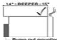
Bump-out mounting bracket