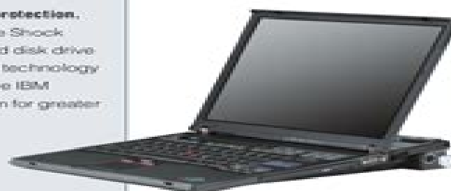
IBM ThinkPad T42 notebook shown, with optional IBM ThinkPad Dock II

"... if an average corporation were to apply best operational practices and IBM's ThinkVantage Technologies as defined today, these customers would potentially see reduced ongoing operating costs greater than the cost of new PC or notebook computer hardware itself."