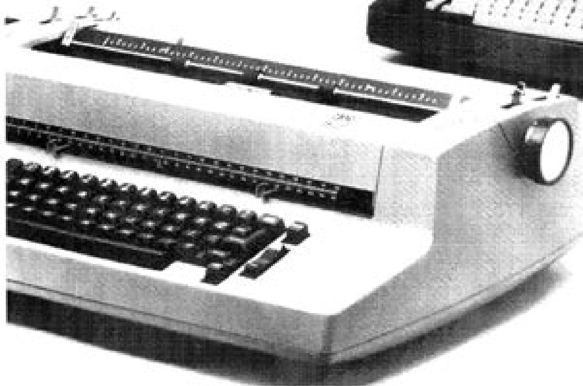
IBM Correcting Selectric® Typewriter