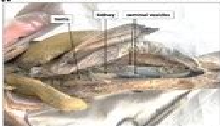
Dogfish Shark Dissection - Internal Male