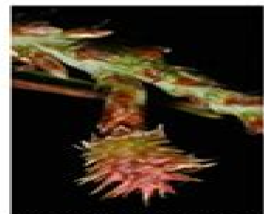
April 15 first year