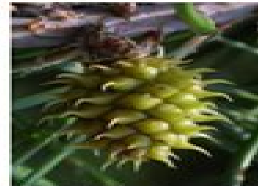
July 3 first year