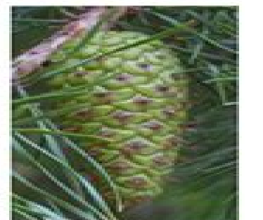
July 3 2 nd year