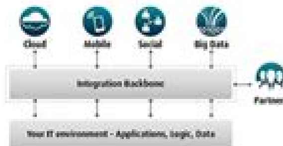
Webmethods integration platform

http://www.redbooks.ibm.com/technotes/tips0925.pdf