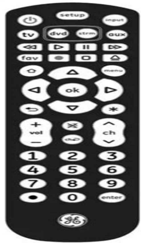
MODELS 33705, 33706 33707, 33708, 34456