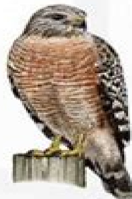
RED SHOULDERED HAWK