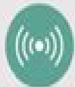
Secured IoT end node sensors