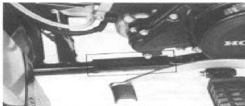
The frame serial number is stamped on the frame left side.