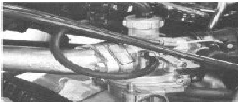
The carburetor identification number is on the left side of the carburetor body left side.