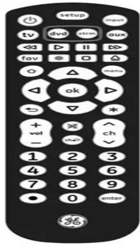
MODELS 33705, 33706 33707, 33708, 34456