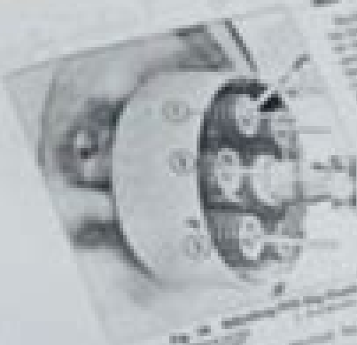
1. The following information is for your information only. It is not intended to be used for any other purpose.

THE NEW SCIENCE ...the ... .. ... .. ... .. ... .. ... .. ... .. ... .. ... .. ... .. ... ..