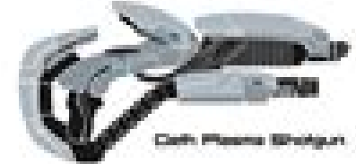
Coh Plasma Shotgun