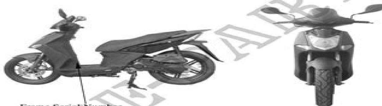
Frame Serial Number