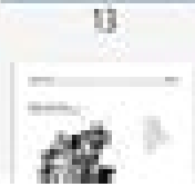
S6D155-4 (WITH STARTING MOTOR) ENGINE SERIAL No. 20000 ~ 24804