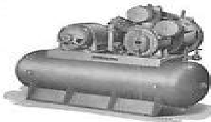
Model 15T15 Compressor

In order to receive maximum performance from your compressor, the complete instructions must be read carefully and all points pertaining to the installation and operation of the unit should be noted. This should be done before connecting anything to either the Compressor or Driver.