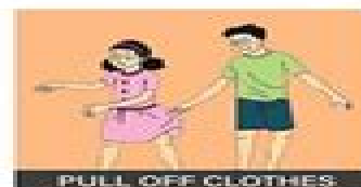
PULL OFF CLOTHES