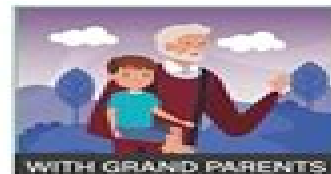
WITH GRAND PARENTS