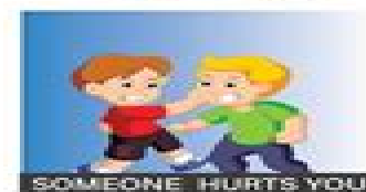
SOMEONE HURTS YOU