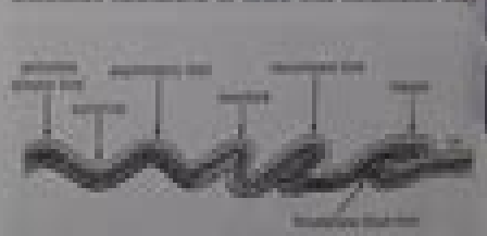
Fig. 19 Types of folding.

is formed (Fig. 19). If it is pushed still further, it becomes a recumbent fold (Fig. 19). In extreme cases, fractures may occur in the crust, so that the upper part of the recumbent fold slides forward over the lower part along a thrust plane , forming an overthrust fold . The over-riding portion of the thrust fold is termed a nappe (Fig. 19). Since the rock strata have been elevated to great heights, sometimes measurable in miles, fold mountains may