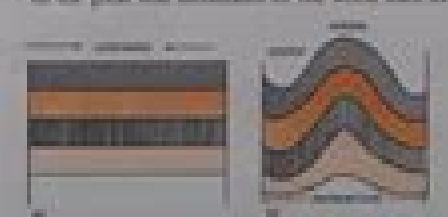
Fig. 18 (a) The horizontal strata of the earth's crust before folding. (b) Compression shortens the crust forming fold mountains.

In the great fold mountains of the world such as