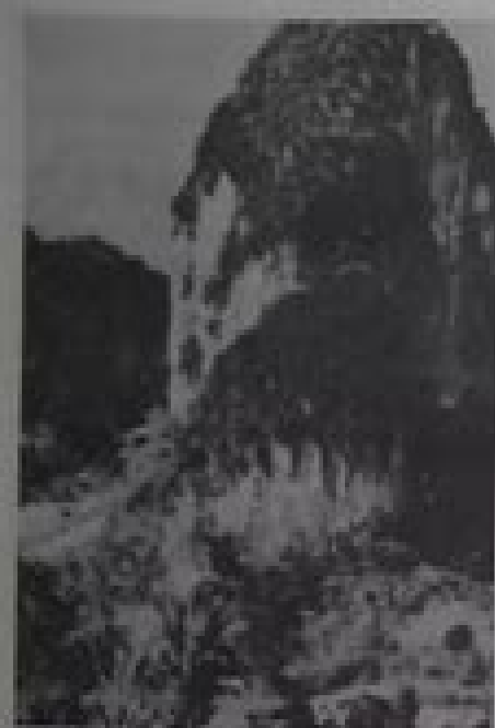
An isolated limestone hill near Ruqia Lumpur. Compare this hill with the limestone features shown in Chapter 7.