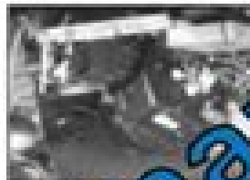
10.31 Pull down the blower motor until it is clear