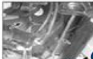
10.32 Remove the blower motor (shown) for clearance to remove the motor housing (shown)