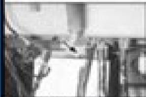
10.29 ... then remove the upper ECU cover (shown) and pull down the ECU, then remove the ECU mounting plate