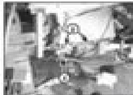
10.28 Remove the screws (6) holding wiring harness in place, then remove the blower motor control ECU (shown)