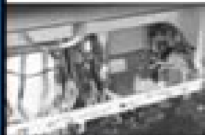
10.26 The right blower housing removed is located behind the glove box area of the dash