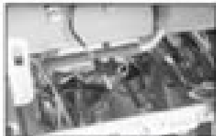
10.30 Two bolts (shown) indicating the left blower motor (the top of the blower housing is the coil)