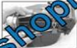
10.33 Remove the two clips (shown) with screws and use screw pulling the halves of the housing together

Remove the screws holding the blower motor in place (see illustration). Then, the four screws from the mounting plate (shown) disconnect the blower motor from the blower housing. Disconnect the blower motor from the blower housing (shown) by pulling the blower motor out of the housing (shown). The blower motor should now drop straight down (shown).